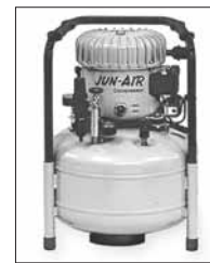
OPTIONAL ULTRA-QUIET LAB/OFFICE COMPRESSOR