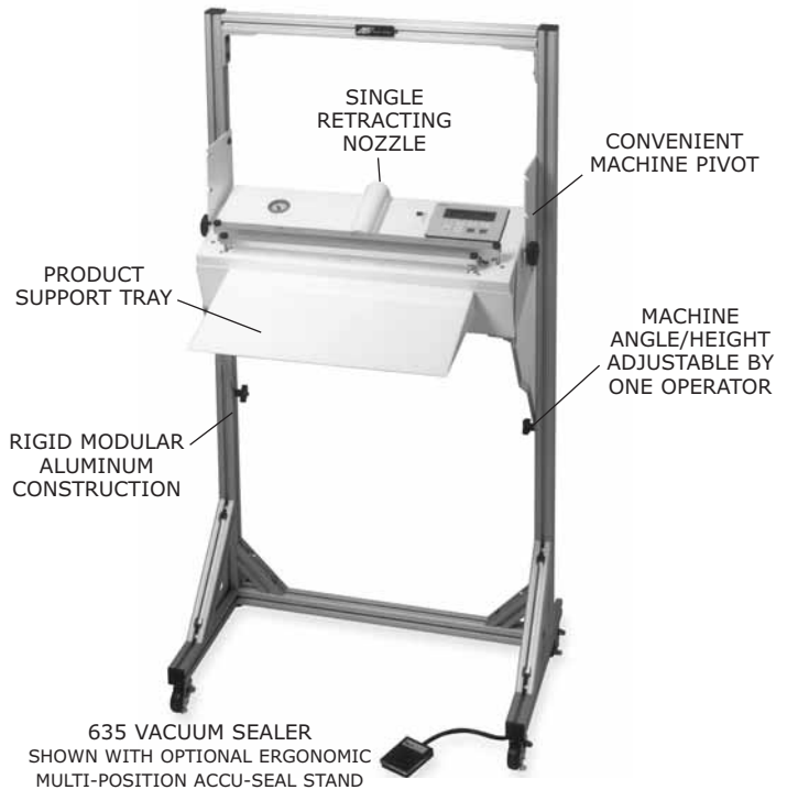
635 VACUUM SEALER SHOWN WITH OPTIONAL ERGONOMIC MULTI-POSITION ACCU-SEAL STAND

The Accu-Seal Model 635 was designed, built, and tested to give years of reliable, trouble free service.