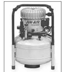
OPTIONAL ULTRA-QUIET LAB/OFFICE COMPRESSOR