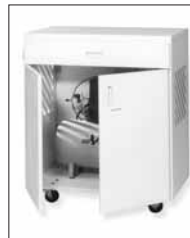
OPTIONAL PORTABLE ACCU-SEALER CART (SHOWN W/INDUSTRIAL COMPRESSOR)

The Accu-Seal Model 35 was designed, built, and tested to give years of reliable, trouble free service.