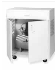
OPTIONAL PORTABLE ACCU-SEALER CART (SHOWN W/INDUSTRIAL COMPRESSOR)

The Accu-Seal Model 235 was designed, built, and tested to give years of reliable, trouble free service.