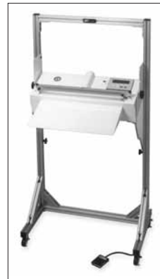
OPTIONAL ERGONOMIC MULTI-POSITION ACCU-SEAL STAND (SHOWN W/ MODEL 635-232)