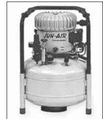
OPTIONAL ULTRA-QUIET LAB/OFFICE COMPRESSOR